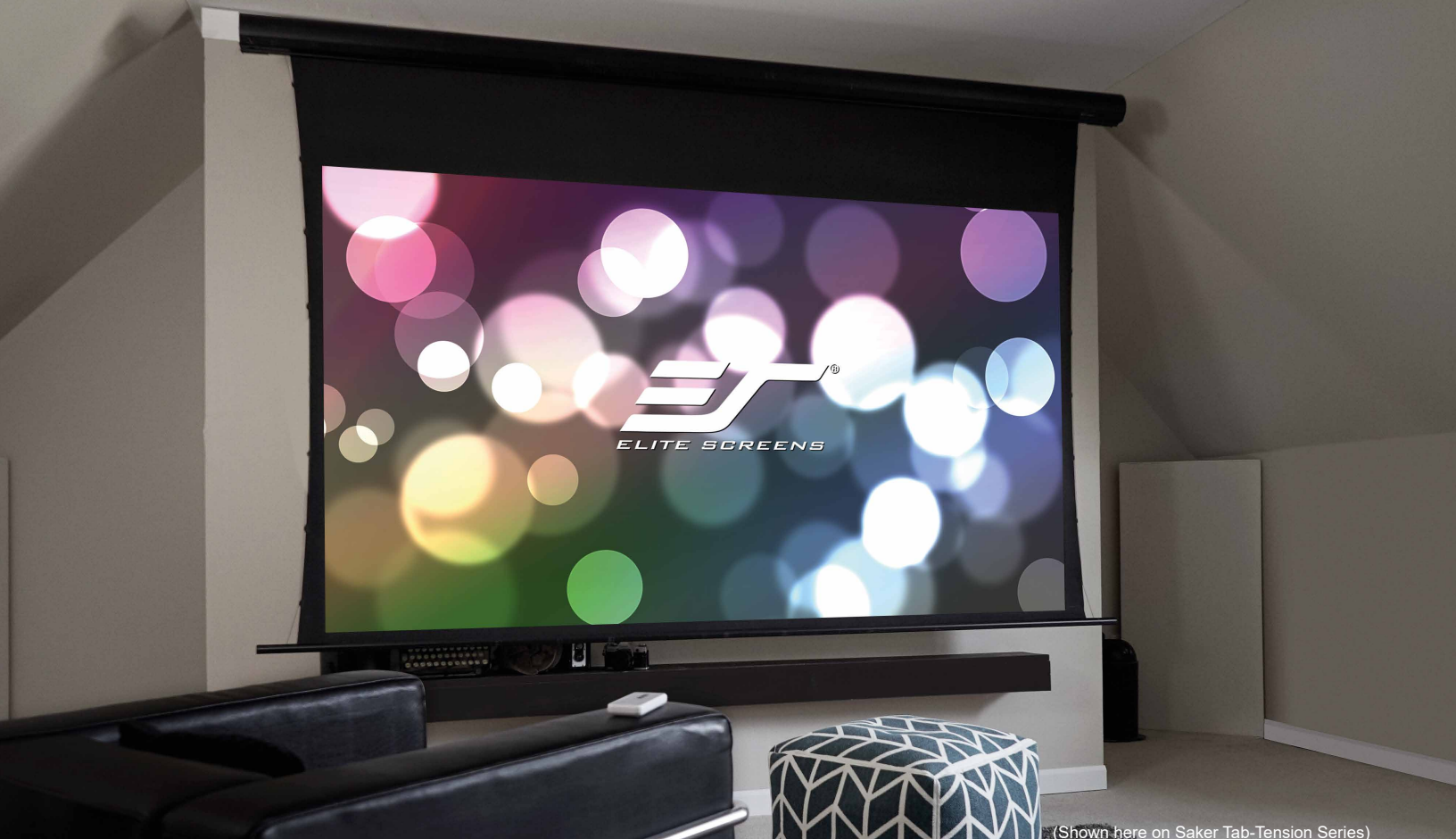
(Shown here on Saker Tab-Tension Series)

MaxWhite® Fiberglass (FG) is fiberglass backed for added stiffness which provides the flattest possible non-tensioned screen surface with universal applications. This material provides wide viewing uniform diffusion while giving precise definition, color reproduction and black & white contrast. The screen surface has a black-backing to eliminate light penetration, is mildew resistant and washable with mild soap and water.