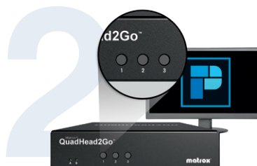
2 Configure using on-device buttons or the Matrox PowerWall software