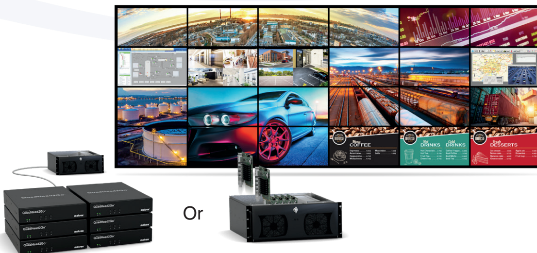
Use multiple QuadHead2Go units (appliances or cards) to easily create and/or expand large-scale video wall solutions