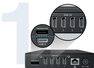
1 Connect using DP 1.2 or HDMI input and 4 HDMI outputs