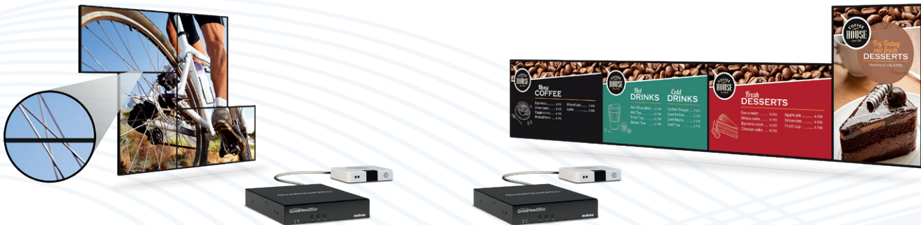
Fine-tune bezels for seamless image displays